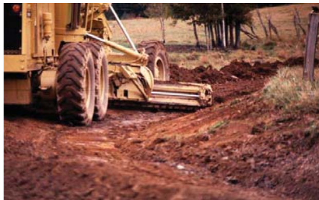
Ditching for Proper Drainage